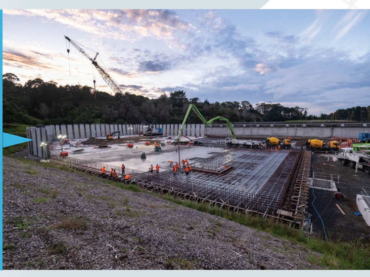
Our third storage reservoir at Redoubt Rd, Manukau, will increase the resilience in our water network and future proof Auckland's water supply by catering for growth